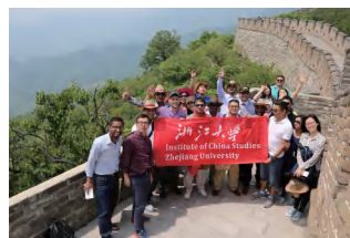
The Great Wall of China