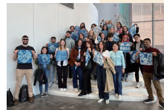
China National Silk Museum