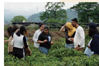
Tea Culture Themed Journey